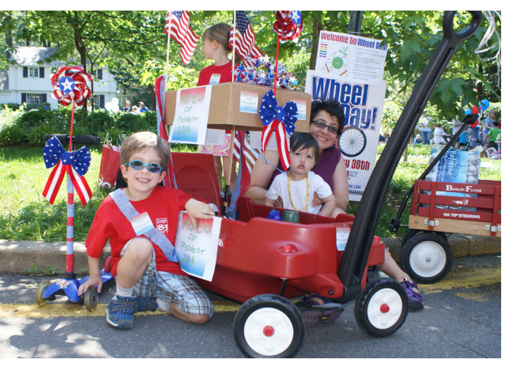
THE WHEEL DAY PARADE ON MEMORIAL DAY WEEKEND.