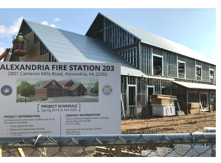
A LOOK AT OUR NEW FIRE STATION.